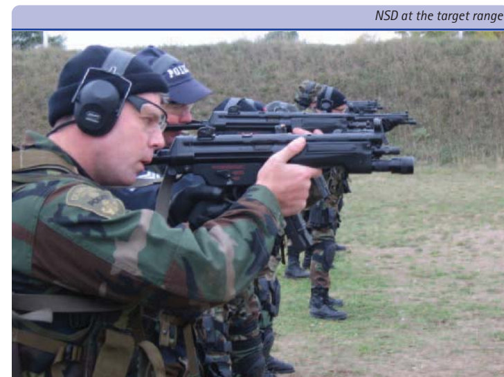
NSD at the target range