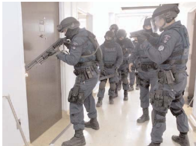
Training in a controlled setting