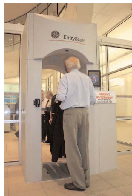
New security building opened in 2006

In 2006, Ontario Power Generation opened new security buildings at the Darlington and Pickering facilities, part of the $300 million it has spent on security upgrades in the past five years. Former DRPS Chief Vern White praised the new facilities at the grand opening event in November 2006 for their robust security screening equipment, including geometric hand monitors, X-ray machines, metal detectors and explosive detection devices.