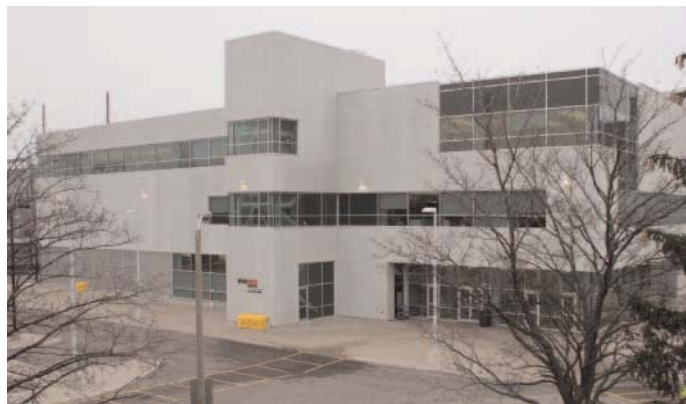
New security building at Pickering