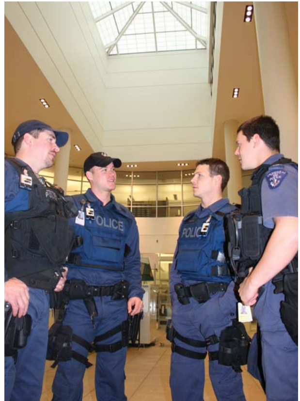
Members of the Nuclear Security Division chat inside one of OPG's security buildings.

In September 2007 Ontario Power Generation and the Durham Regional Police Service announced the transition from a DRPS to an OPG Trained Armed Nuclear Response Force as the preferred, long-term security model. Our Nuclear Security Leadership Team is working collaboratively with OPG to plan for a seamless transition to their own highly trained and qualified armed response team over the coming years.