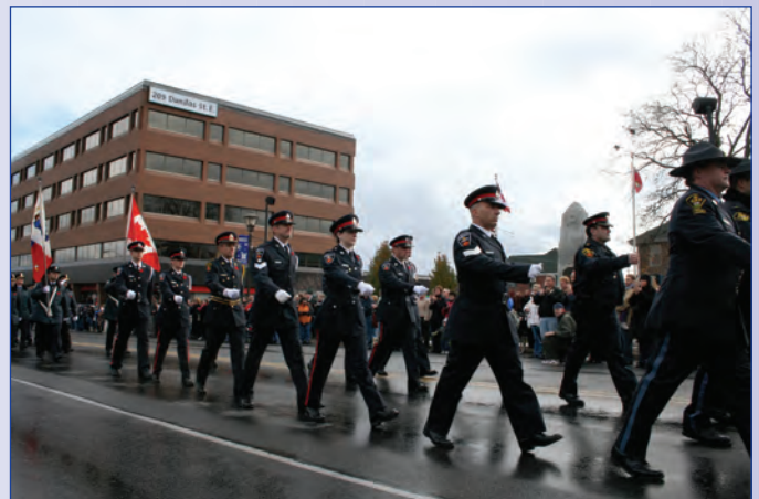
Members of 18 Division proudly participated in Remembrance Day ceremonies in Whitby.