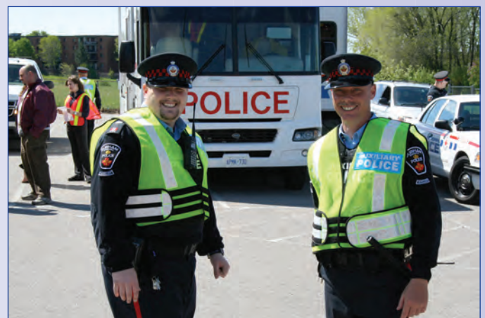
Auxiliary Constables help with a traffic calming initiative in Oshawa.