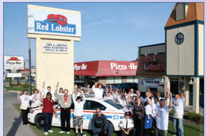
DRPS members helped raise funds for Special Olympics Ontario at an Oshawa restaurant.