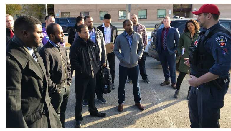
In 2019, 74 recruiting events were held, including job fairs, cultural festivals and an all-day Diversity Recruiting Symposium, where more than 80 people attended.