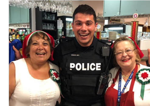
Members attended events and pavilions at the annual Fiesta Week in Oshawa. This annual celebration of the cultures is a highlight for many residents.